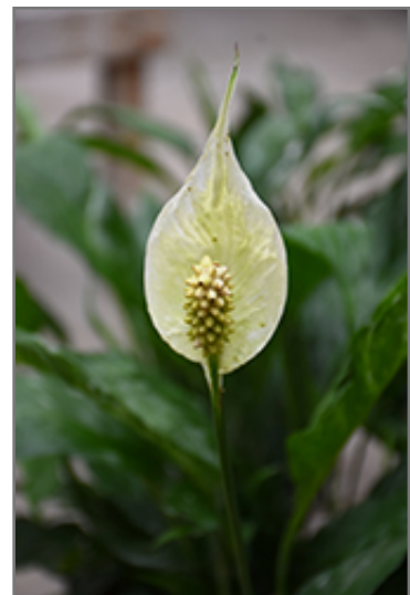
Domino Peace Lily flowers