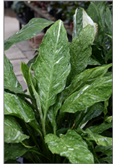
Domino Peace Lily foliage

This is a dense herbaceous evergreen houseplant with an upright spreading habit of growth. Its relatively coarse texture stands it apart from other indoor plants with finer foliage. This plant may benefit from an occasional pruning to look its best.