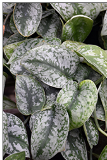
Silver Satin Pothos foliage

When grown indoors, Silver Satin Pothos can be expected to grow to be about 10 feet tall at maturity, with a spread of 24 inches. It grows at a medium rate, and under ideal conditions can be expected to live for approximately 10 years. This houseplant performs well in both bright or indirect sunlight and strong artificial light, and can therefore be situated in almost any well-lit room or location. It does best in average to evenly moist soil, but will not tolerate standing water. The surface of the soil shouldn't be allowed to dry out completely, and so you should expect to water this plant once and possibly even twice each week. Be aware that your particular watering schedule may vary depending on its location in the room, the pot size, plant size and other conditions; if in doubt, ask one of our experts in the store for advice. It will benefit from a regular feeding with a general-purpose fertilizer with every second or third watering. It is not particular as to soil type or pH; an average potting soil should work just fine. Be warned that parts of this plant are known to be toxic to humans and animals, so special care should be exercised if growing it around children and pets.