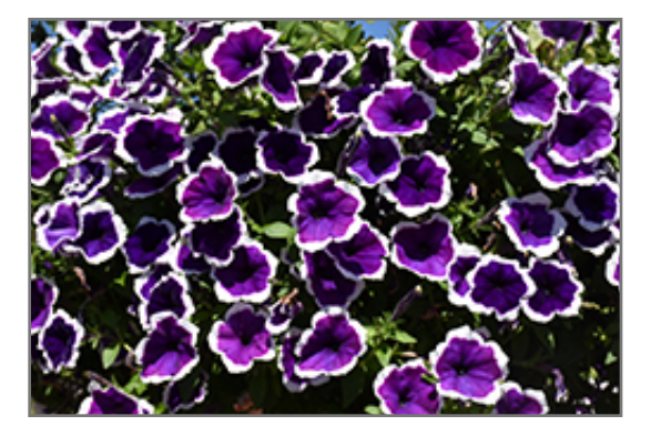
Headliner Dark Violet Picotee Petunia flowers