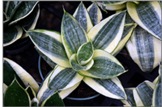
Hahnii Marginated Snake Plant flowers

This plant does best in partial shade to shade. It is very adaptable to both dry and moist growing conditions, but will not tolerate any standing water. It is considered to be drought-tolerant, and thus makes an ideal choice for a low-water garden or xeriscape application. This plant should not require much in the way of fertilizing once established, although it may appreciate a shot of general-purpose fertilizer from time to time early in the growing season. It is not particular as to soil pH, but grows best in sandy soils. It is highly tolerant of urban pollution and will even thrive in inner city environments. This is a selected variety of a species not originally from North America. It can be propagated by division; however, as a cultivated variety, be aware that it may be subject to certain restrictions or prohibitions on propagation.