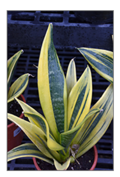
Golden Flame Snake Plant flowers

This plant does best in partial shade to shade. It is very adaptable to both dry and moist growing conditions, but will not tolerate any standing water. It is considered to be drought-tolerant, and thus makes an ideal choice for a low-water garden or xeriscape application. This plant should not require much in the way of fertilizing once established, although it may appreciate a shot of general-purpose fertilizer from time to time early in the growing season. It is not particular as to soil pH, but grows best in sandy soils. It is highly tolerant of urban pollution and will even thrive in inner city environments. This is a selected variety of a species not originally from North America. It can be propagated by division; however, as a cultivated variety, be aware that it may be subject to certain restrictions or prohibitions on propagation.