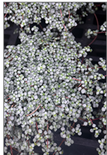
Aquamarine Pilea foliage