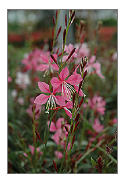
Ballerina Rose Gaura flowers

Ballerina Rose Gaura is recommended for the following landscape applications;