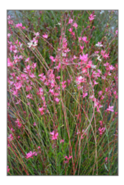
Ballerina Rose Gaura in bloom