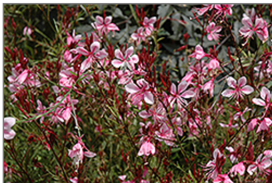
Butterfly Gaura flowers