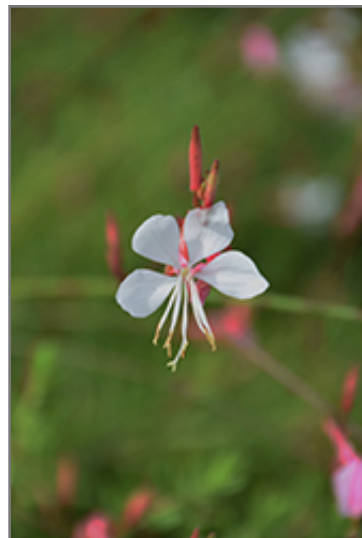
Butterfly Gaura flowers

This is a relatively low maintenance plant, and is best cleaned up in early spring before it resumes active growth for the season. It is a good choice for attracting butterflies to your yard, but is not particularly attractive to deer who tend to leave it alone in favor of tastier treats. It has no significant negative characteristics.