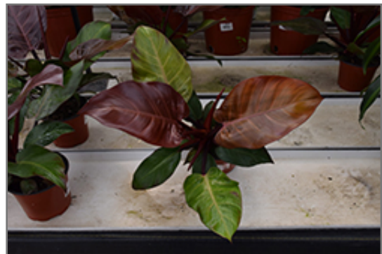
McColley's Finale Philodendron in full