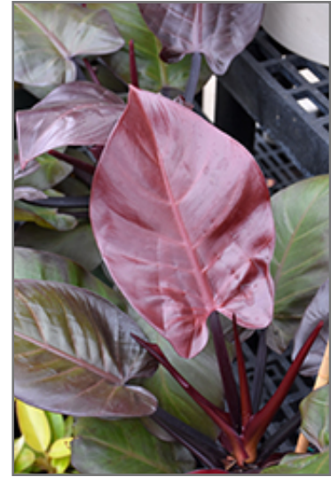
McColley's Finale Philodendron foliage

This is a dense herbaceous evergreen houseplant with an upright spreading habit of growth. This plant should not require much pruning, except when necessary to keep it looking its best.