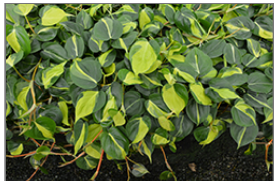
Brasil Philodendron foliage