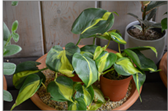
Brasil Philodendron in full

This is a dense herbaceous evergreen houseplant with a spreading, ground-hugging habit of growth. Its relatively coarse texture stands it apart from other indoor plants with finer foliage. This plant can be pruned at any time to keep it looking its best.