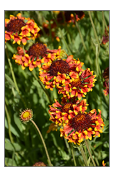
Fanfare Blanket Flower flowers

Compact mounds of gray-green foliage present unique pinwheel flowers of scarlet red, orange and yellow; eye-catching when added to borders, beds and containers; heat and drought tolerant; excellent cut-flower; remove spent flowers to encourage new growth