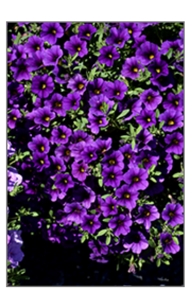
MiniFamous Neo Dark Blue Calibrachoa flowers

An early flowering and uniform trailing series presenting boldly colored blooms, cascading from small, green foliage; a stellar performer with a summer-long display of color in hanging baskets and combination planters