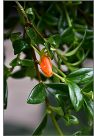
Goldfish Plant flowers

This is a dense herbaceous evergreen houseplant with a trailing habit of growth, eventually spilling over the edges of hanging baskets and containers. This plant can be pruned at any time to keep it looking its best.