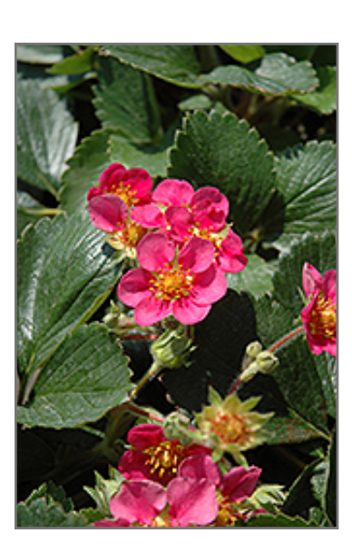
Shades Of Pink Strawberry flowers