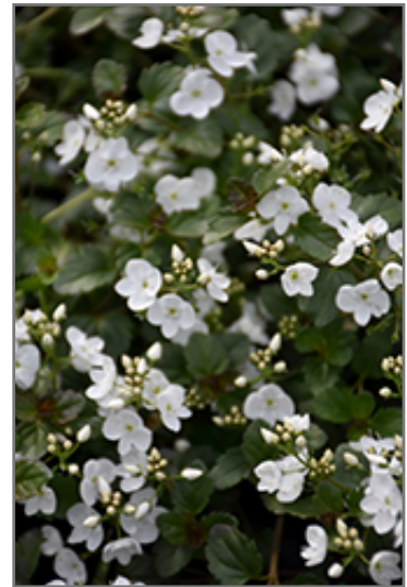
Whitewater Speedwell flowers

Whitewater Speedwell is recommended for the following landscape applications;