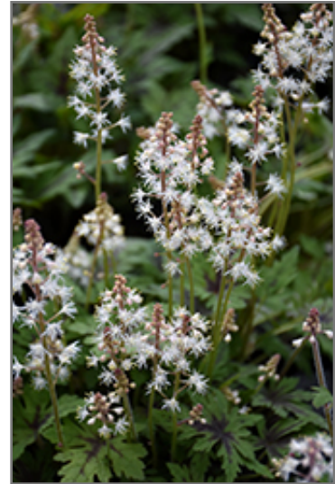
Timbuktu Foamflower flowers

Timbuktu Foamflower is recommended for the following landscape applications;