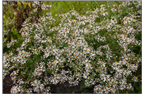
White Wood Aster flowers

White Wood Aster is recommended for the following landscape applications;