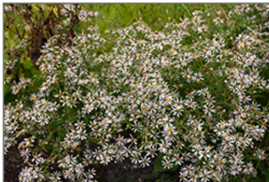
White Wood Aster flowers

White Wood Aster is recommended for the following landscape applications;