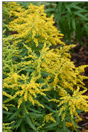
Little Miss Sunshine Goldenrod flowers