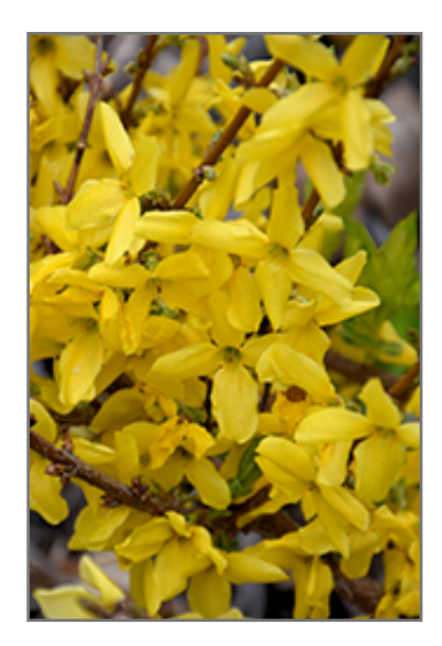
Fiesta Forsythia flowers

This is a relatively low maintenance shrub, and should only be pruned after flowering to avoid removing any of the current season's flowers. Deer don't particularly care for this plant and will usually leave it alone in favor of tastier treats. It has no significant negative characteristics.