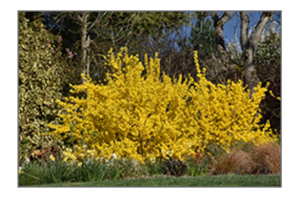
Fiesta Forsythia in bloom