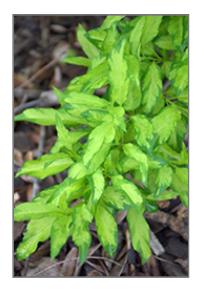
Fiesta Forsythia foliage

This shrub should only be grown in full sunlight. It is very adaptable to both dry and moist locations, and should do just fine under typical garden conditions. It is not particular as to soil type or pH, and is able to handle environmental salt. It is highly tolerant of urban pollution and will even thrive in inner city environments. This particular variety is an interspecific hybrid.