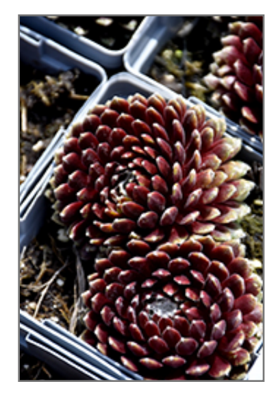
Mona Lisa Hens And Chicks