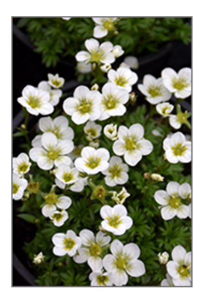
Rocco White Saxifrage flowers