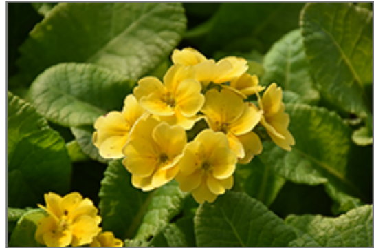
Pacific Giant Yellow Primrose flowers