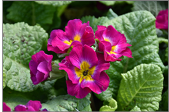
Pacific Giant Purple Primrose flowers