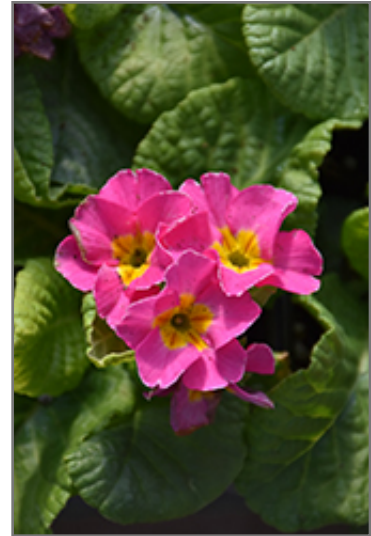
Pacific Giant Pink Primrose flowers