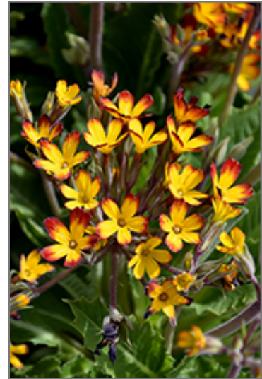
Oakleaf Yellow Picotee Primrose flowers