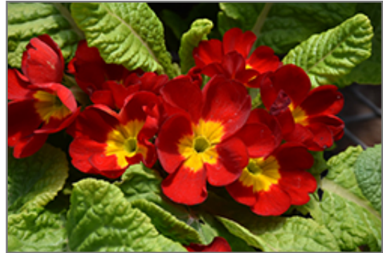
Danova Red Primrose flowers