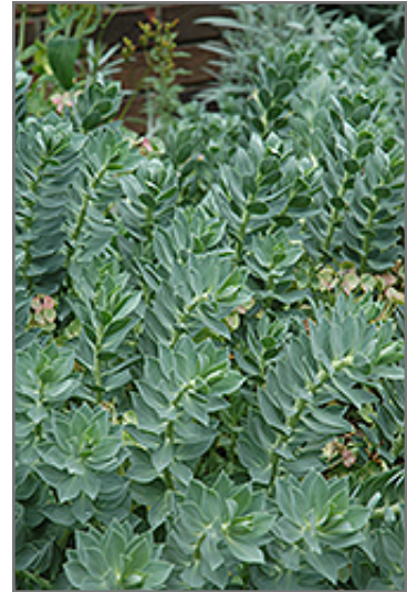
Donkey-Tail Spurge foliage

This is a high maintenance plant that will require regular care and upkeep, and should only be pruned after flowering to avoid removing any of the current season's flowers. Deer don't particularly care for this plant and will usually leave it alone in favor of tastier treats. Gardeners should be aware of the following characteristic(s) that may warrant special consideration;