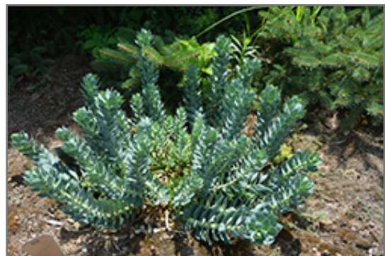
Donkey-Tail Spurge