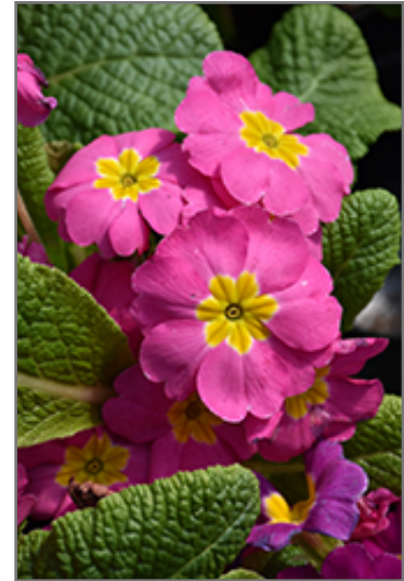
Danova Pink Primrose flowers