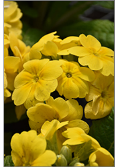
Danova Lemon Yellow Primrose flowers