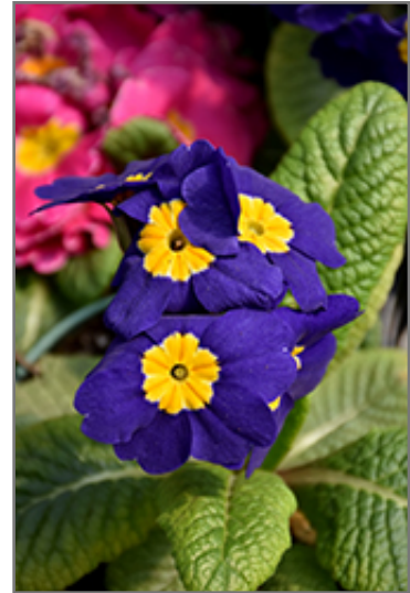
Danova Blue Primrose flowers