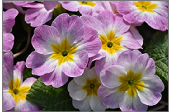
Danova Appleblossom Bicolor Primrose flowers