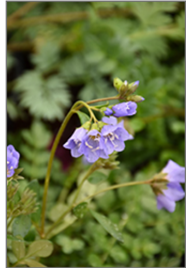
Blue Pearl Jacob's Ladder flowers