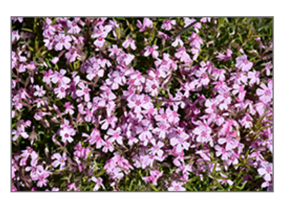
Spring Pink with Dark Eye Moss Phlox flowers

This variety produces a showy display of bright, light pink flowers with dark rose eyes smothering the plant in late spring; prune lightly after flowering to encourage a dense growth habit; wonderful for rock gardens, edging, or in mixed containers