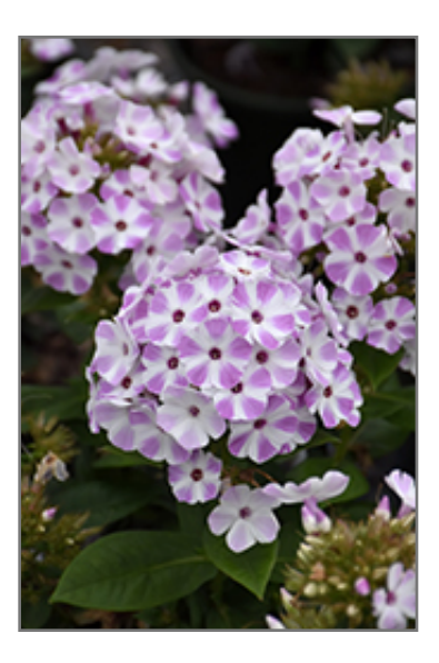
Flame Lilac Star Garden Phlox flowers

Exceptional fragrant lilac purple and white striped flowers on sturdy stems, bloom prolifically all summer; smaller compact plant suitable for containers or small perennial borders; good mildew resistance; attracts hummingbirds and pollinators