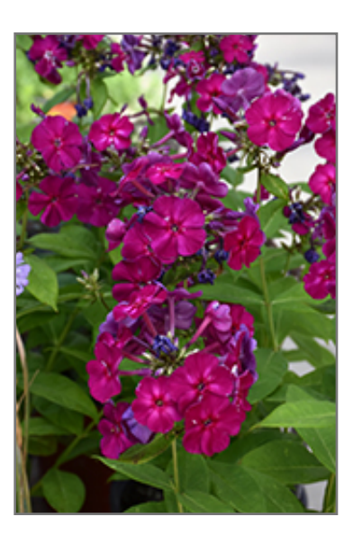
Flame Pro Cerise Garden Phlox flowers

An early flowering variety, producing blooms of fragrant, cherry red flowers with rose eyes, on compact plants suitable for the front of borders; provides a long season of color; thick, glossy green foliage has excellent mildew resistance