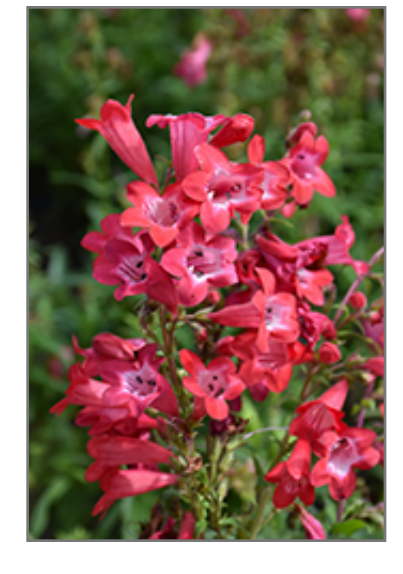
Quartz Red Beard Tongue flowers

A vigorous, sturdy and upright selection, with large, scarlet red colored flowers with striped white throats; re-blooms throughout the season; stunning as a complement to other perennials; great for borders, along walkways, or in containers