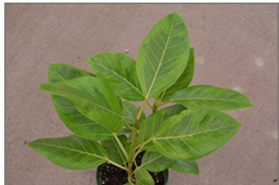
Altissima Council Tree in full