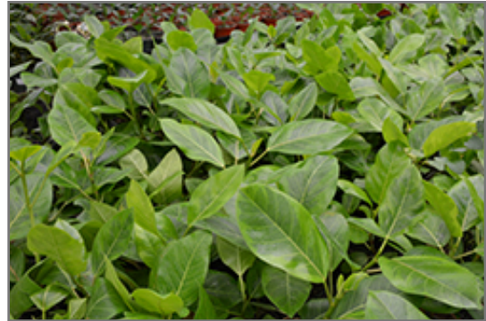
Altissima Council Tree foliage

This is a multi-stemmed evergreen houseplant with an upright spreading habit of growth. This plant should not require much pruning, except when necessary to keep it looking its best.