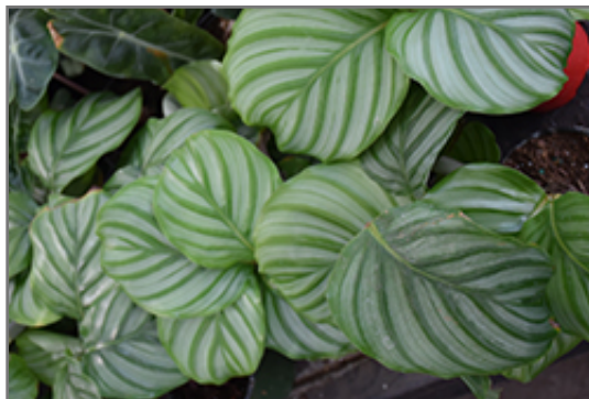
Orbifolia Prayer Plant foliage

When grown indoors, Orbifolia Prayer Plant can be expected to grow to be about 3 feet tall at maturity, with a spread of 24 inches. It grows at a slow rate, and under ideal conditions can be expected to live for approximately 5 years. This houseplant performs well in both bright or indirect sunlight and strong artificial light, and can therefore be situated in almost any well-lit room or location. It does best in average to evenly moist soil, but will not tolerate standing water. The surface of the soil shouldn't be allowed to dry out completely, and so you should expect to water this plant once and possibly even twice each week. Be aware that your particular watering schedule may vary depending on its location in the room, the pot size, plant size and other conditions; if in doubt, ask one of our experts in the store for advice. It will benefit from a regular feeding with a general-purpose fertilizer with every second or third watering. It is not particular as to soil pH, but grows best in rich soil. Contact the store for specific recommendations on pre-mixed potting soil for this plant.