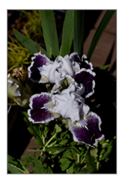
Puddy Tat Iris flowers