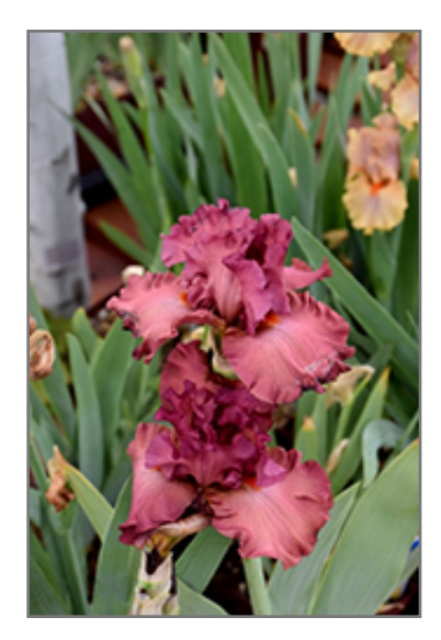
Code Red Iris flowers

A beautiful selection perfect for creating an impact in garden beds and borders; elegant cranberry red blooms with orange beards and heavily ruffled falls and standards; mid to late spring blooming; remove spent flowers after blooming