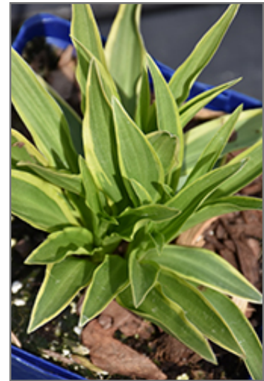
Sandhill Crane Hosta