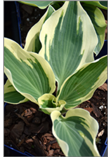
Firn Line Hosta