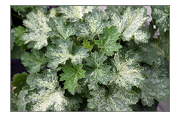
Dew Drops Coral Bells foliage