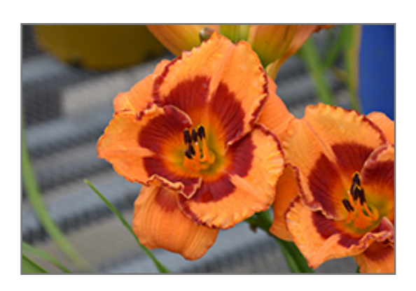
You Are My Sunshine Daylily flowers