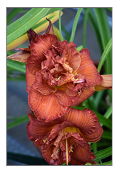
Orange You Lucky Daylily flowers

Eye-catching deep orange double blooms stand tall above low growing mounds of arching green foliage; a repeat bloomer, perfect for accenting borders, beds and containers; low maintenance and easy to grow; drought tolerant once established