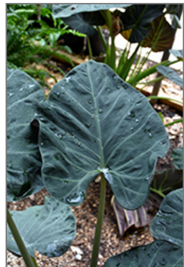
Mythic Regal Shields Elephant Ears foliage