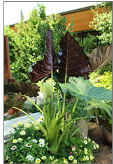
Mythic Regal Shields Elephant Ears

This is an open herbaceous evergreen houseplant with an upright spreading habit of growth. This plant usually looks its best without pruning, although it will tolerate pruning.