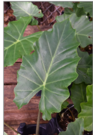
Mythic Portora Elephant Ears foliage