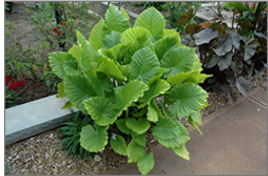
Mythic Portora Elephant Ears

This is an open herbaceous evergreen houseplant with an upright spreading habit of growth. This plant usually looks its best without pruning, although it will tolerate pruning.