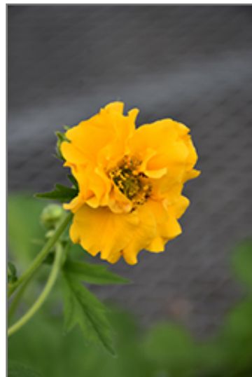
Lady Stratheden Avens flowers