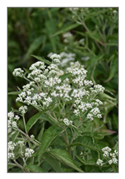
Polished Brass Joe Pye Weed flowers

Densely packed clusters of soft white flowers sit atop green, lance shaped foliage tinged with red; compact, short and bushy habit; low maintenance, perfect for borders, cottage gardens or as an accent plant; great cut flower