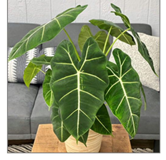
Mythic Frydek Elephant Ears in full

Amazing large heart shaped leaves are velvety and dark green, with prominent, bright white veins; a visually elegant indoor accent in bright indirect light